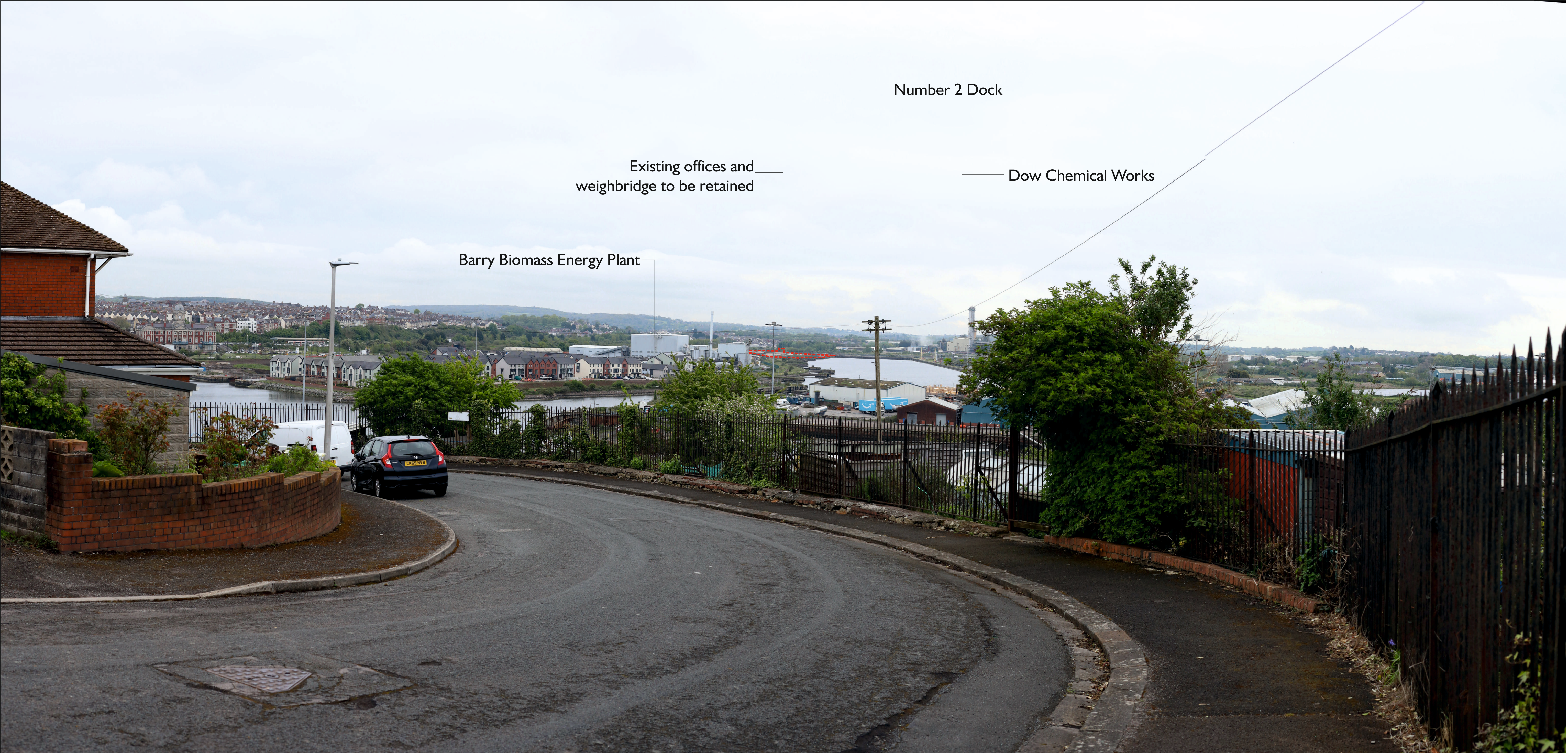
Representative Viewpoint I6 - Looking northeast from Dyfrig St near junction with Redbrink Crescent, Redbrink Point (Distance to the Site - 1.42km)